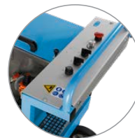
Clear, user-friendly control panel